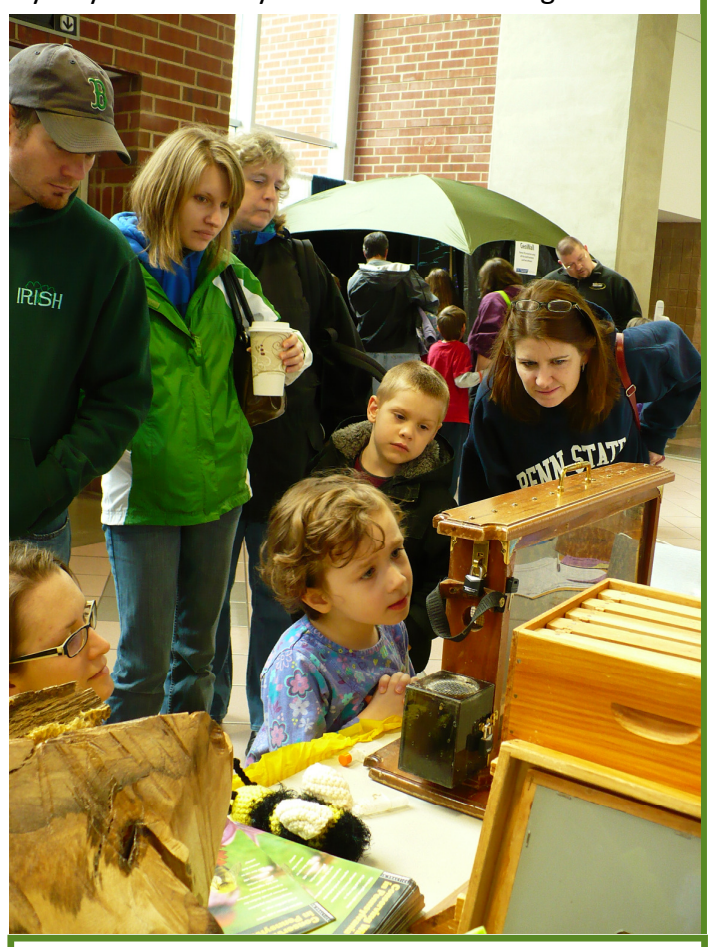
Families examine and interact with a pollinator exhibit at Penn State's Exploration Days, April 2011.

You can also be a mentor to a group of underprivileged high school students as a part of Penn State's SEECoS (Summer Experience in the Eberly College of Science) program. These students come to Penn State for 6 weeks to do a small research project in a lab while taking courses. 99% of the students in these programs go on to graduate from high school and are subsequently accepted into postsecondary educational institutions.